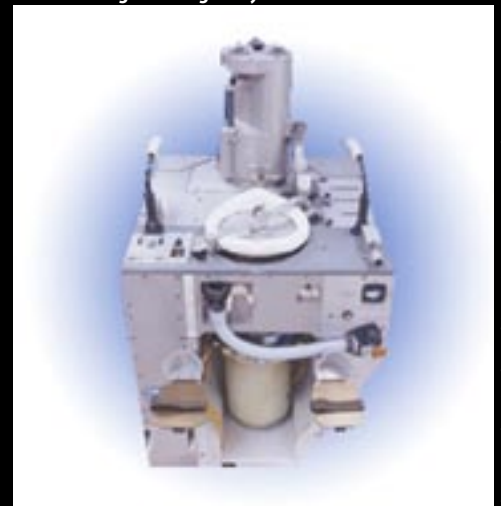
Figure 3. The toilet scheduled for use on ISS. Note the thigh bars that hold the user in place to keep them from floating off in 0 gravity.

The solid products from the space toilet are not reused in the ISS. The urine is collected in a separate urinal-type device, and the solid waste from the toilet is collected and disposed of on Earth. Because there is no gravity on the ISS, the user first must sit on the seat and pull around thigh bars that hold him in place (see Figure 3). Then he turns on a vacuum that pulls